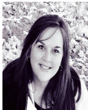
Our girl is turning 60, Sept 29... don't tell anyone.